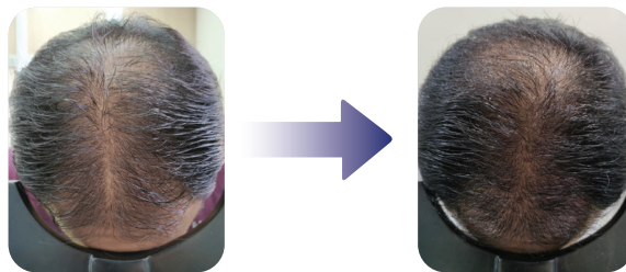
Standard overall photograph before and after treatment